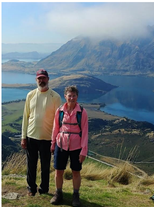
The view from the top of Rocky Mountain