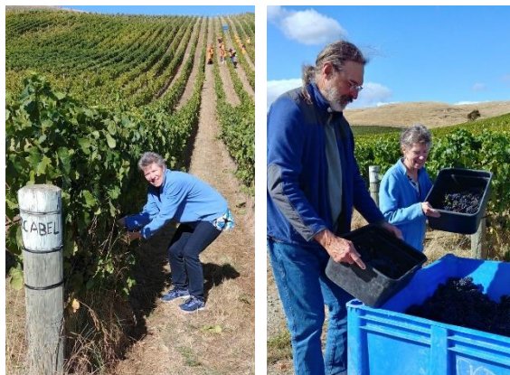
Vineyard workers from another hemisphere!