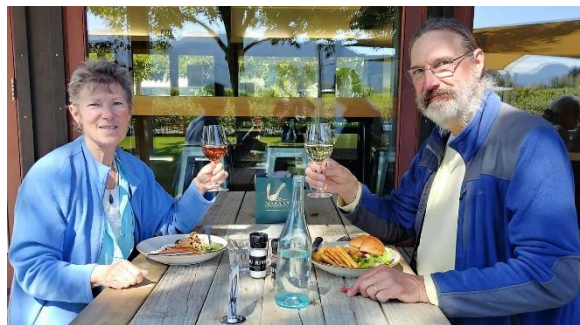
To all – Good Health!